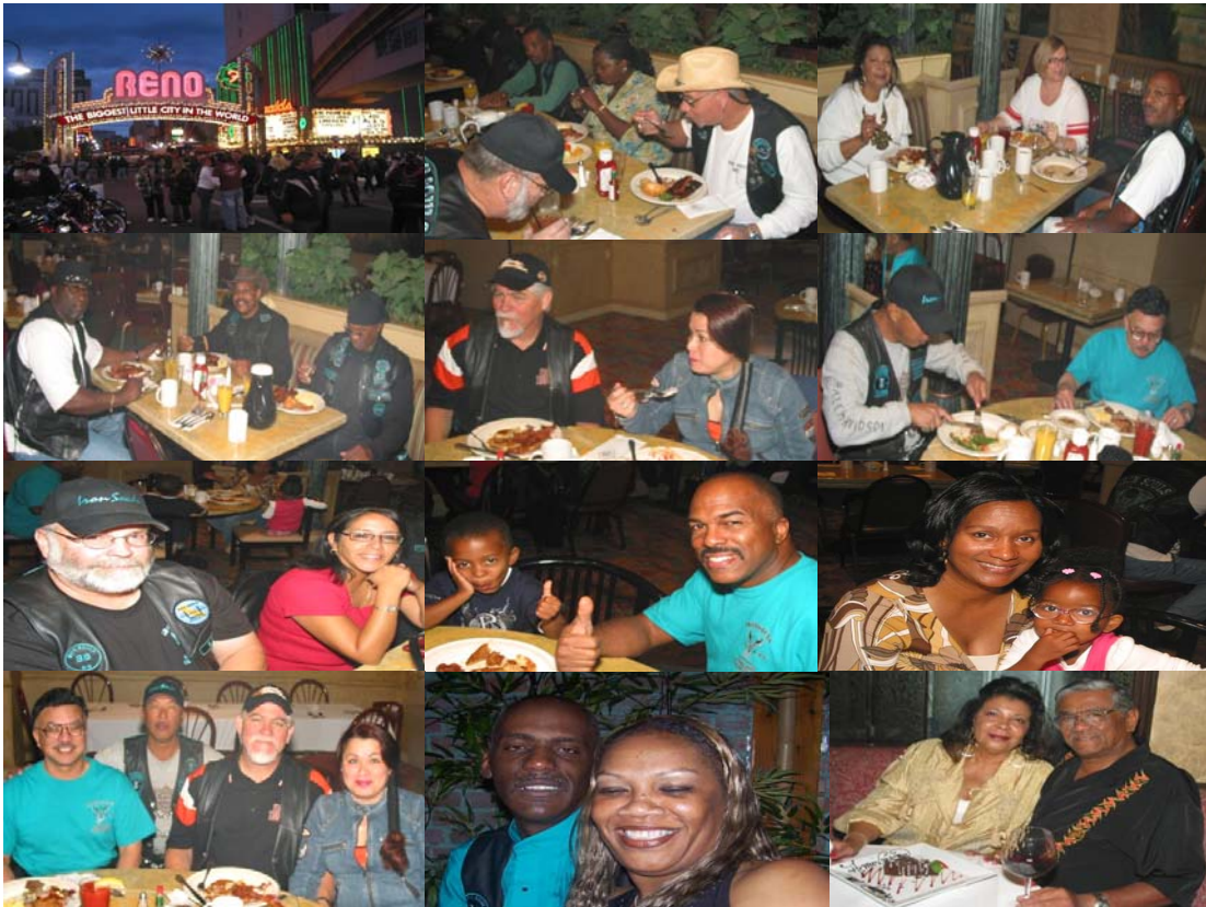
ISMC Says Happy Anniversary: